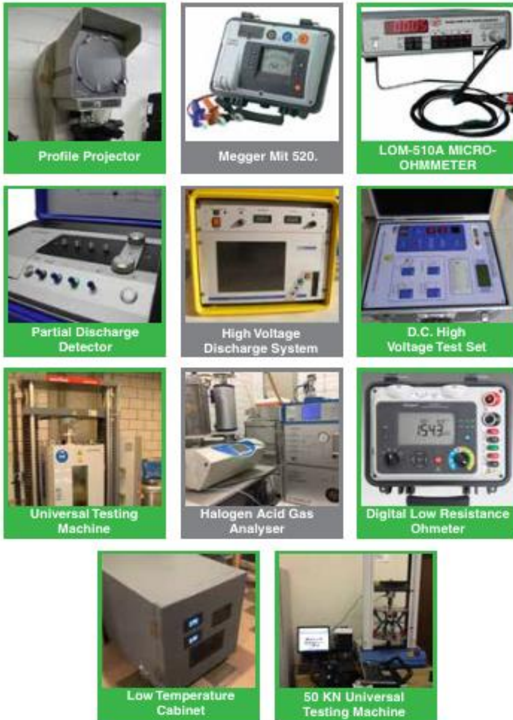
Figure 2. Testing Facility at Pakistan Cables Ltd.